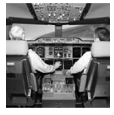
INSIDE CAE'S A380 SIMULATOR

The simulator features a 24-foot dome display—the largest dome display ever placed on a motion-based flight simulator—to provide pilots with an extreme field-of-view during training. It also incorporates a six-degree-of-freedom vibration platform that works together with aural and visual cues to deliver a highly realistic cockpit environment for the aircrew.