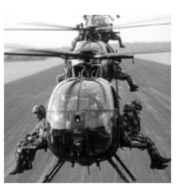
THE AH/MH-6 "LITTLE BIRD" HELICOPTER