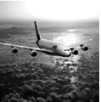
THE AIRBUS A380 SUPER JUMBO JETLINER